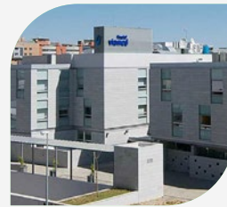
Viamed Santa Ángela de la Cruz Hospital