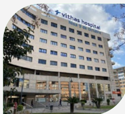
9 de Octubre Hospital