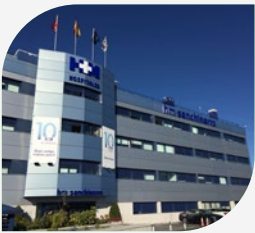
Madrid Norte Sanchinarro Hospital