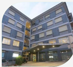
Virgen Blanca Clinic