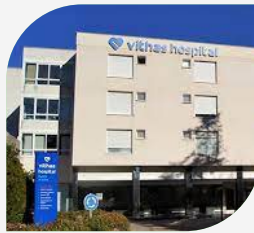
Vithas Pardo de Aravaca Hospital