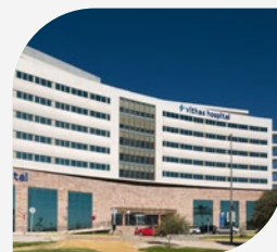
Vithas Sevilla-Aljarafe Hospital